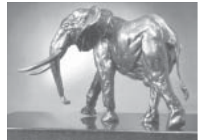
"Elephant Field Study"

The works of American sculptor Bart Walter will be featured at the Museum beginning March 23, 2002. Bart Walter: Soul of Africa will highlight over twenty-five works including small sculptures created in the wild, a series of charcoal sketches that the artist uses for reference, and life-size bronze sculptures of African wildlife. This range of work will bring Walter's entire creative process into focus in the Museum's galleries. The exhibit will run through July 21, 2002. The Herbert W. Hoover Foundation and Key & McDonald Investments are sponsoring the exhibition.